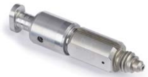
Round Mix Chamber