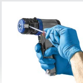
Remove the cartridge