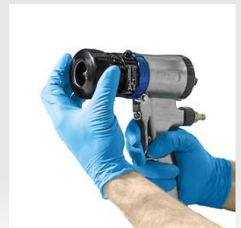
Install the retaining ring and aircap