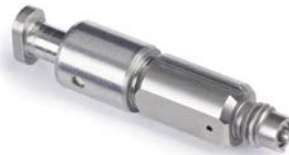
Flat Mix Chamber